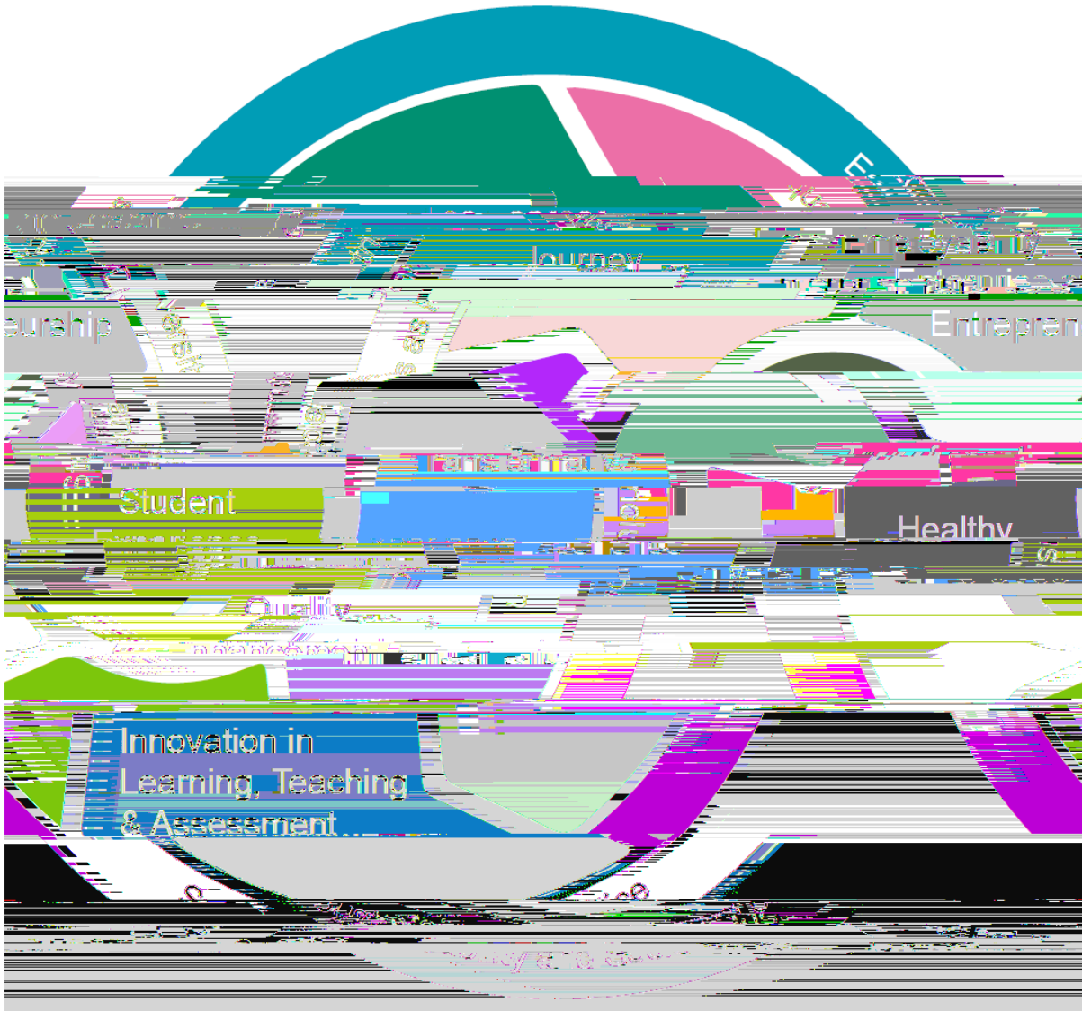
The QMU Student Experience Strategy 2021-26.

As the infographic shows, key areas of priority are presented under one of five action headings. These are supported by three overarching themes of Equality, Diversity and Inclusion; Students as Partners; and Sustainability and Social Justice that cut across the student experience during the period of Strategy. These themes are fundamental to the delivery of an outstanding student experience, and underpin all of our actions and activities