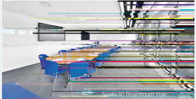
Seats 30 Boardroom style